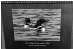
2010 Calendar $20