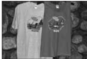
Tank Tops Adult $15 (sm - xxl)