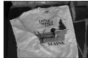
Sweatshirt Youth $15 Adult $20