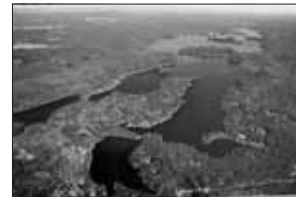
Aerial Photo $20