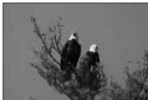
Little Sebago Eagles (8" x 10") $12