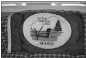
LSLA Flag (2' x 3') $70