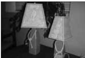
Lampshade Map & Base sm $60 / lg $75

*Order Lamps & Shades directly form "Shades of Maine: 207-215-4552