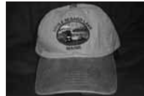
Ball Cap $20