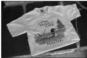
T-Shirt Youth $10 Adult $15