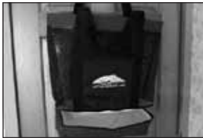
Tote & Cooler $12