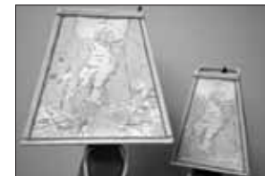
Lampshade Map Only sm $40 / lg $55

*Order Lamps & Shades directly form "Shades of Maine: 207-215-4552